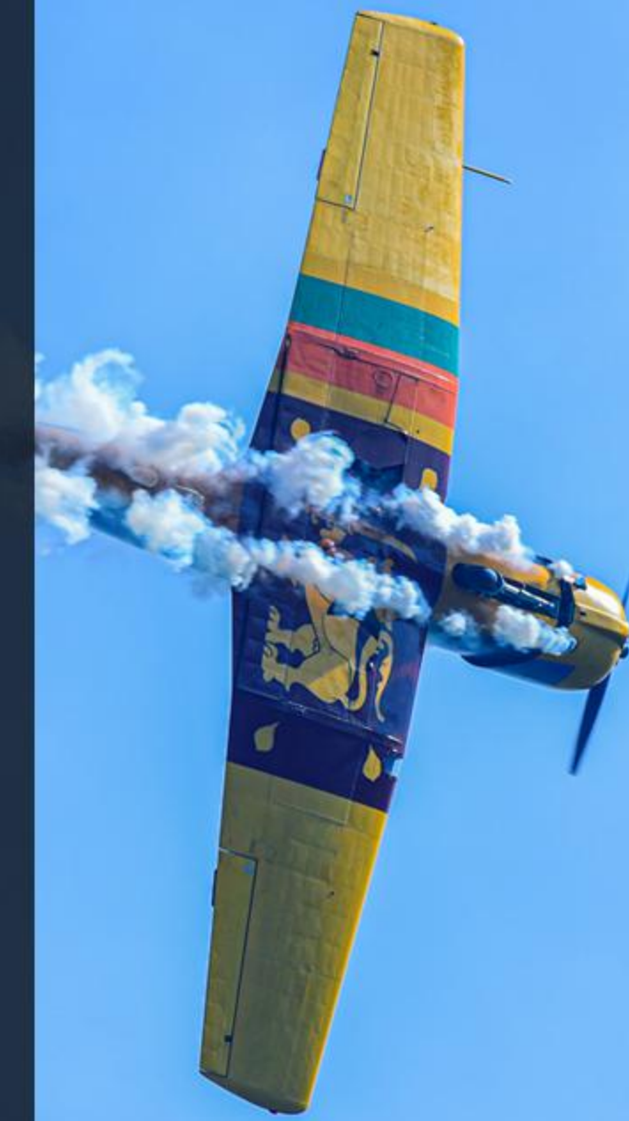
AEROBATICS AND AIR DISPLAYS